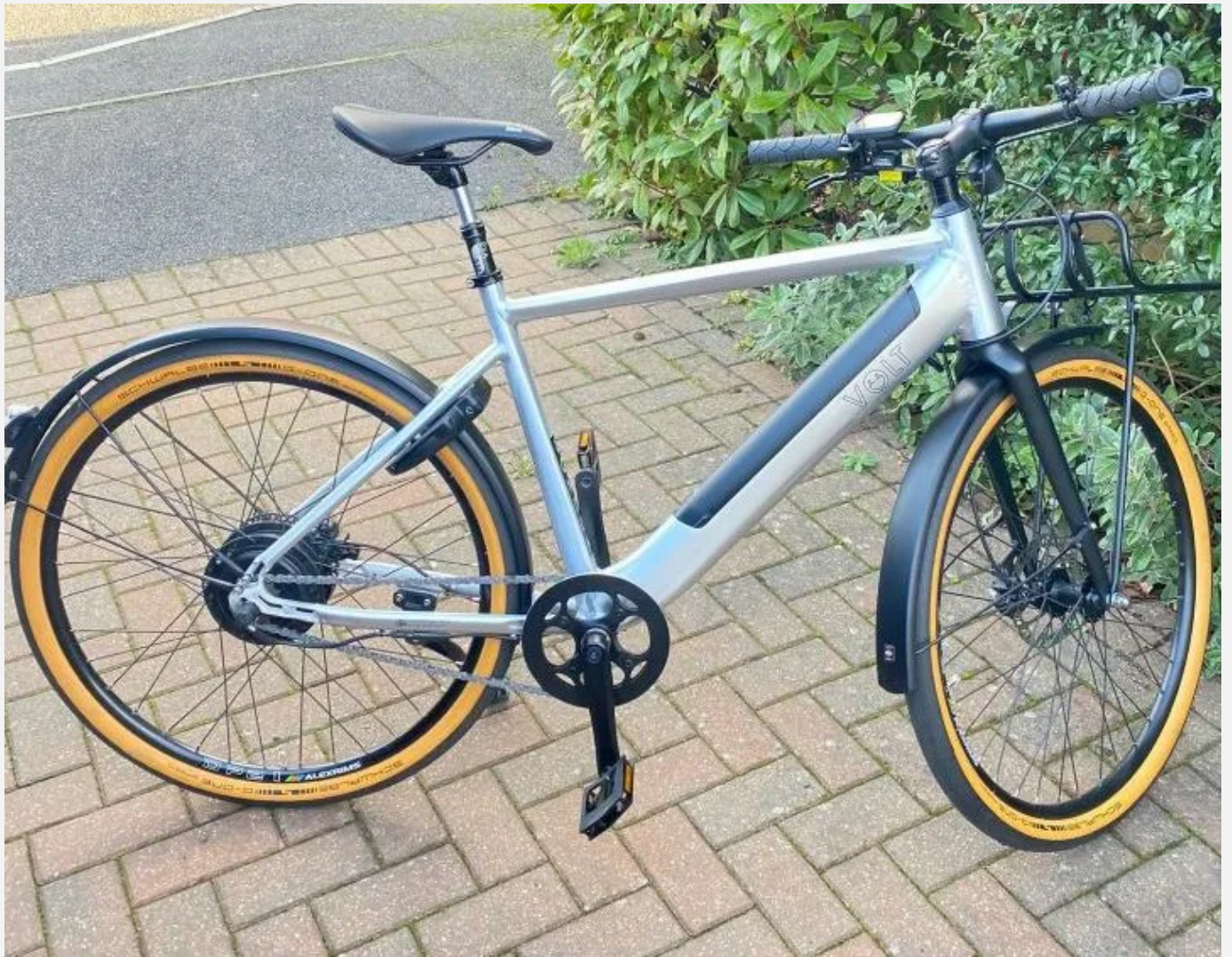
The Volt London has built-in road lights, ABUS security lock, suspension seat post and a torque sensor

It's sleek, attractive, almost industrial design garnered praise at the Red Dot Design Awards, where it won Best Bicycle Design in 2022. It's brushed raw aluminium finish belies a ruggedness that will cope with all the city streets can throw at it.